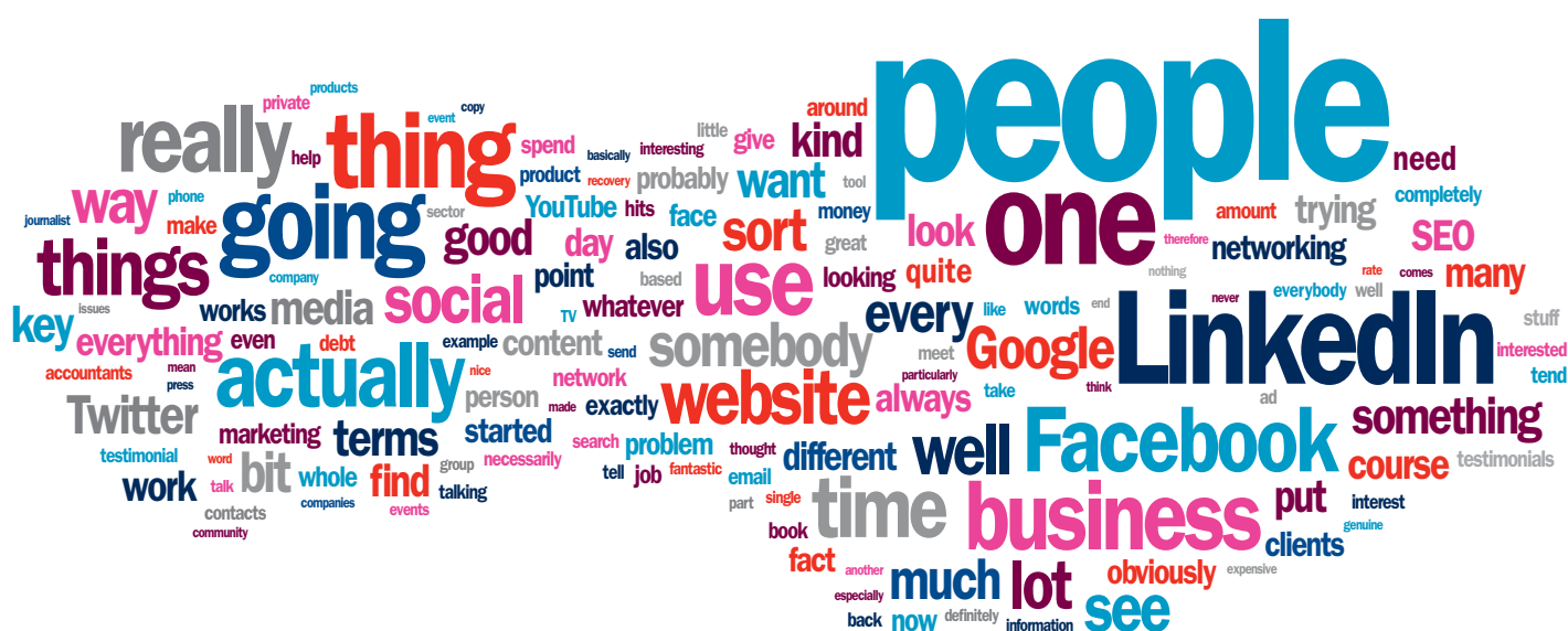
Source: Focus groups discussion with 20 SMEs

Facebook has sort of degenerated slightly into a bit of chaos, but it's still a good marketing tool if you've got a product.